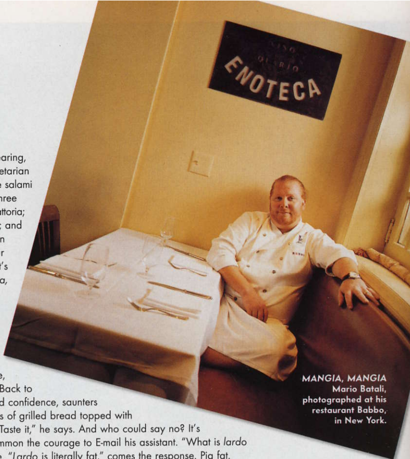
MANGIA, MANGIA Mario Batali, photographed at his restaurant Babbo, in New York.