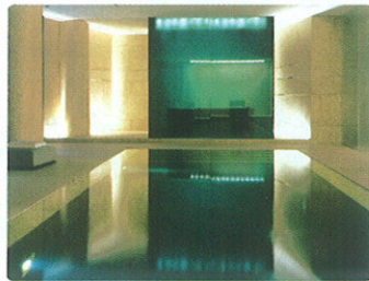
Bulgari Hotel, Milan Zen-like decor, great food and a peaceful garden make this an unusual destination