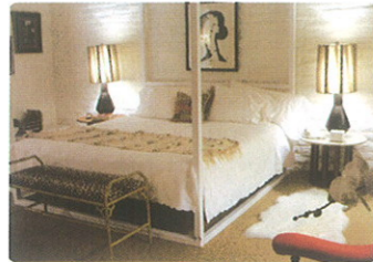
Le Parker Meridien, Palm Springs Hipster designer Jonathan Adler has given this resort and spa a fresh and luxurious 1950s flavor

The best new hotels combine intimacy and design—and service