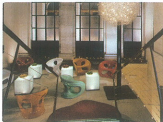
Hotel Art, Rome This gem of a hotel was once a chapel, hence the frescoed ceiling in the spacious lobby