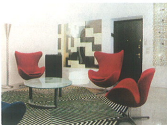
3 Rooms, Milan and Paris Two versions of this ultraprivate fashion must-see exist, one in Azzedine Alaïa's headquarters