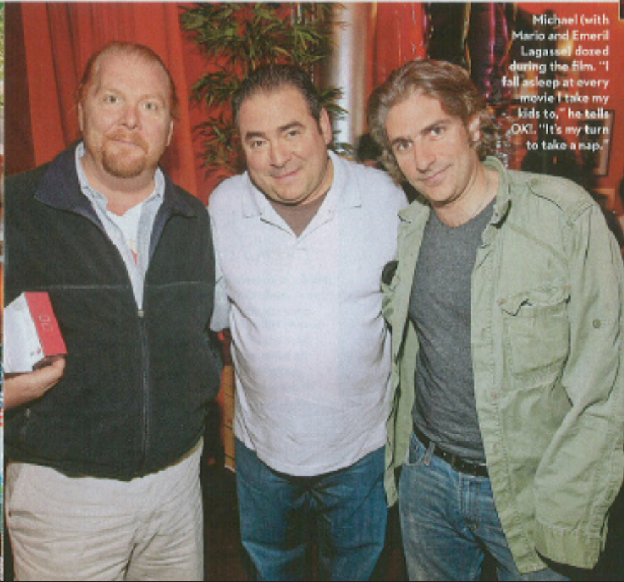
Michael (with Mario and Emeril Lagasse) dozed during the film. "I fall asleep at every movie I take my kids to," he tells OK!. "It's my turn to take a nap."