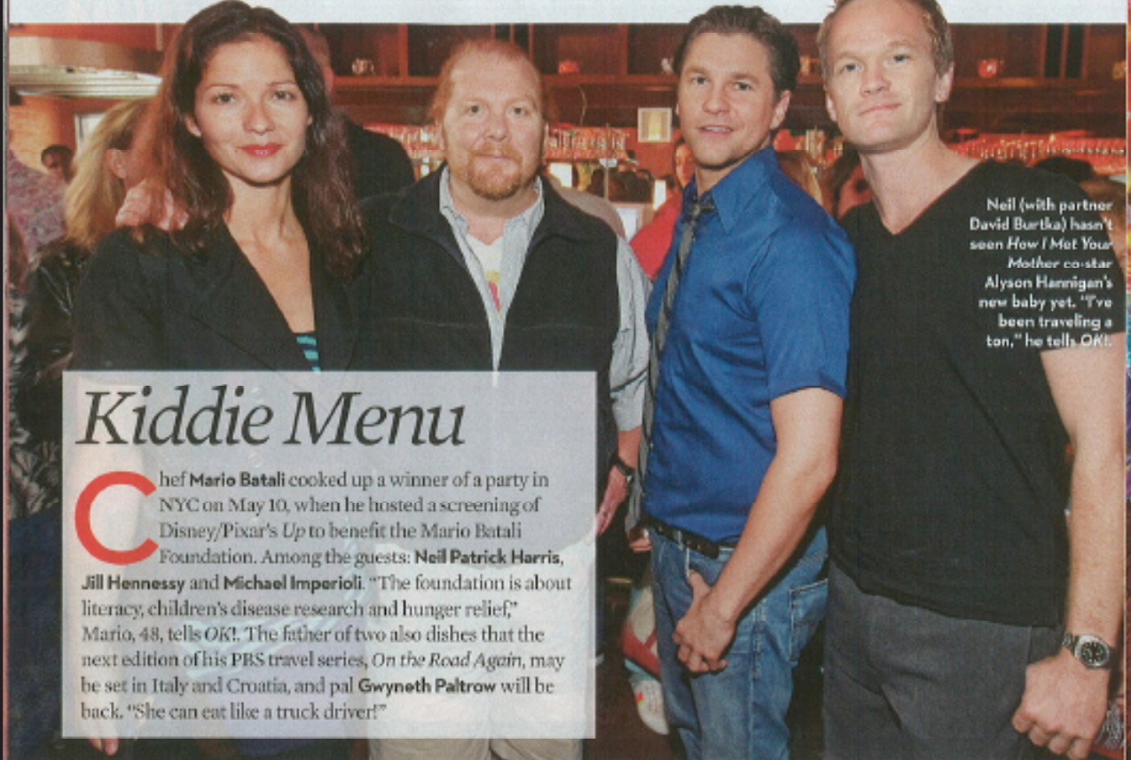
Neil (with partner David Burtka) hasn't seen How I Met Your Mother co-star Alyson Hannigan's new baby yet. "I've been traveling a ton," he tells OK!