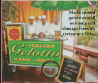
Mario served gelato as well as meats and cheeses from his restaurant Otto.

C hef Mario Batali cooked up a winner of a party in NYC on May 10, when he hosted a screening of Disney/Pixar's Up to benefit the Mario Batali Foundation. Among the guests: Neil Patrick Harris , Jill Hennessy and Michael Imperioli . "The foundation is about literacy, children's disease research and hunger relief," Mario, 48, tells OK!. The father of two also dishes that the next edition of his PBS travel series, On the Road Again , may be set in Italy and Croatia, and pal Gwyneth Paltrow will be back. "She can eat like a truck driver!"