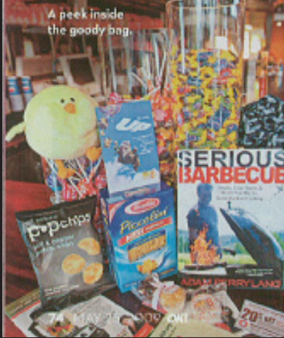
A peek inside the goody bag.