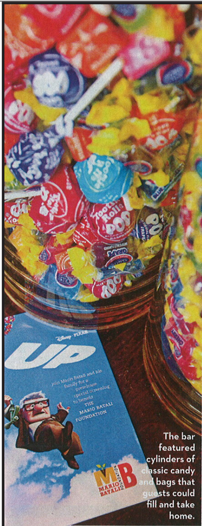
The bar featured cylinders of classic candy and bags that guests could fill and take home.