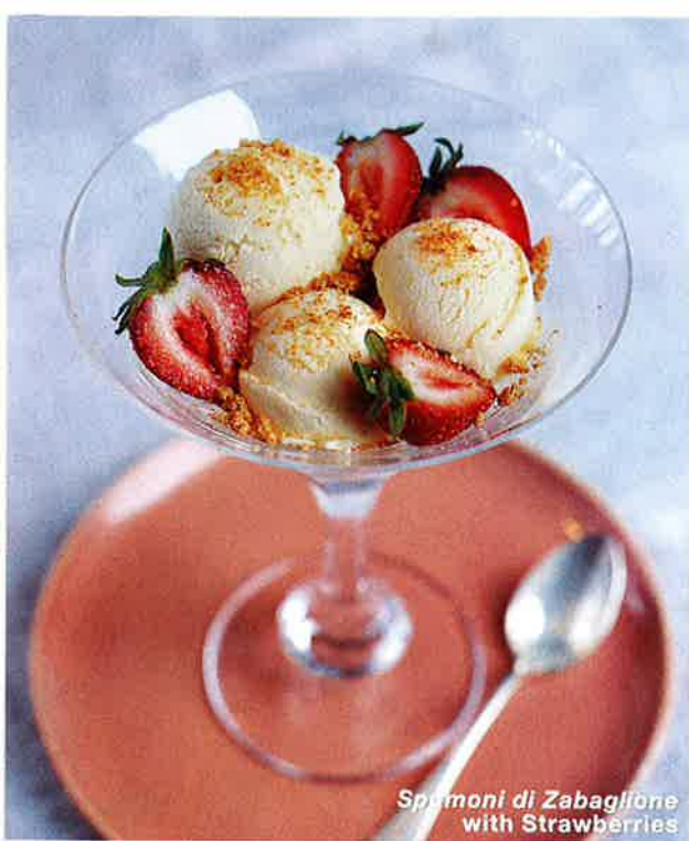
Sprigoni di Zabaglione with Strawberries