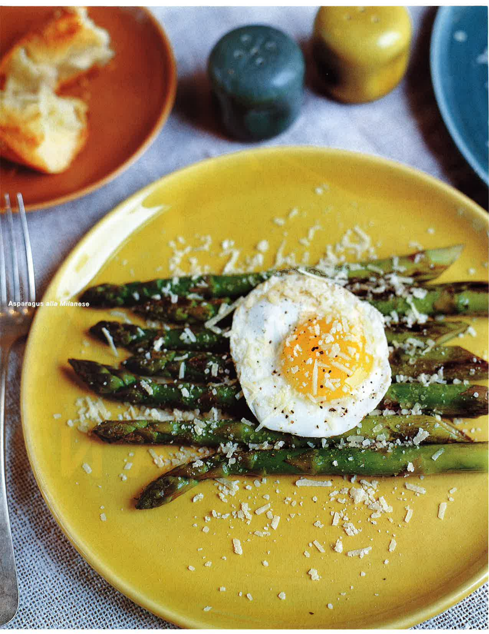
Asparagus alla Milanese