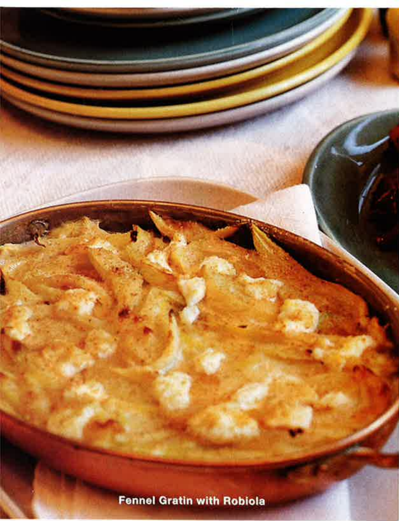
Fennel Gratin with Robiola