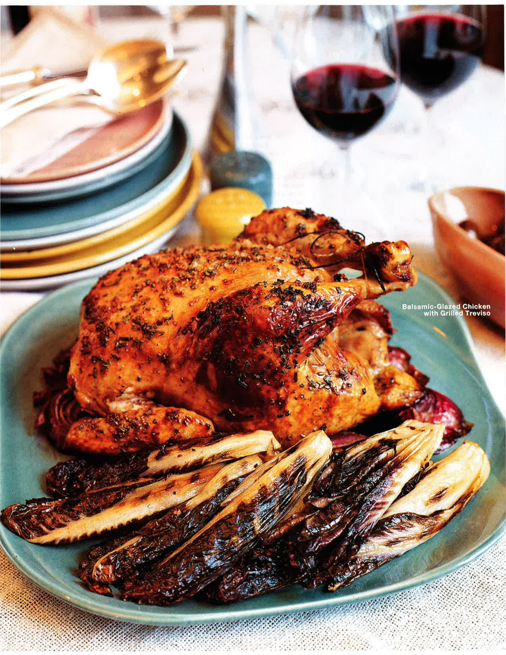
Balsamic-Glazed Chicken with Grilled Treviso