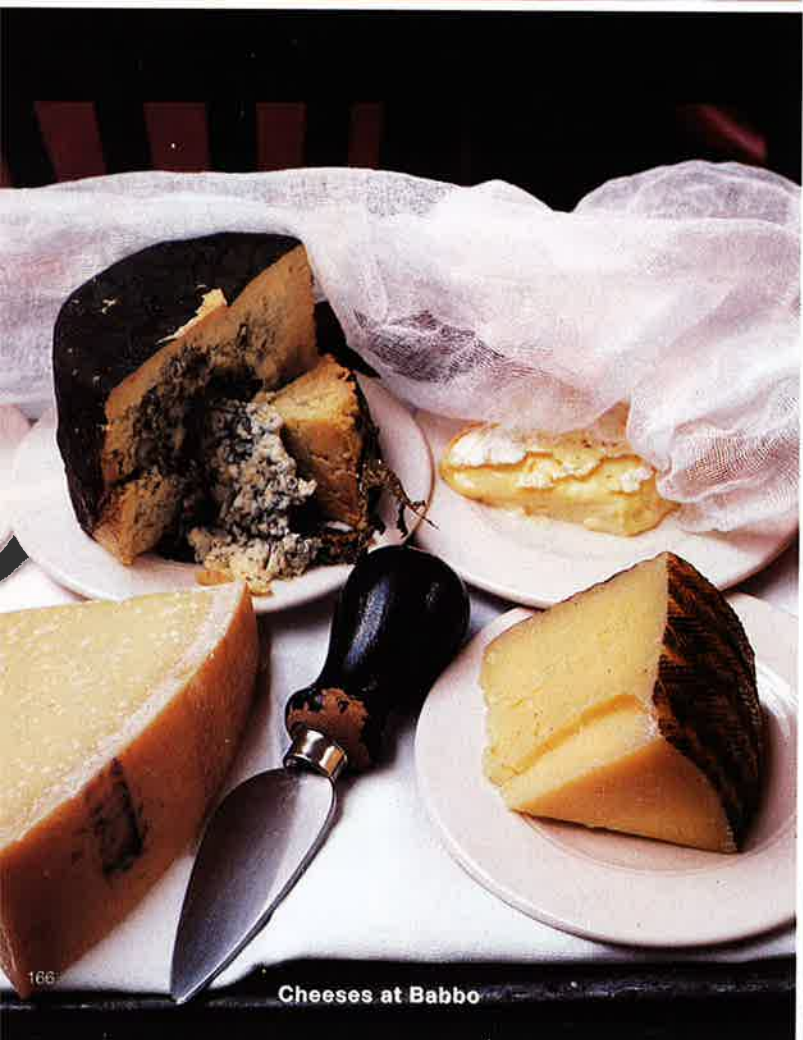
Cheeses at Babbo