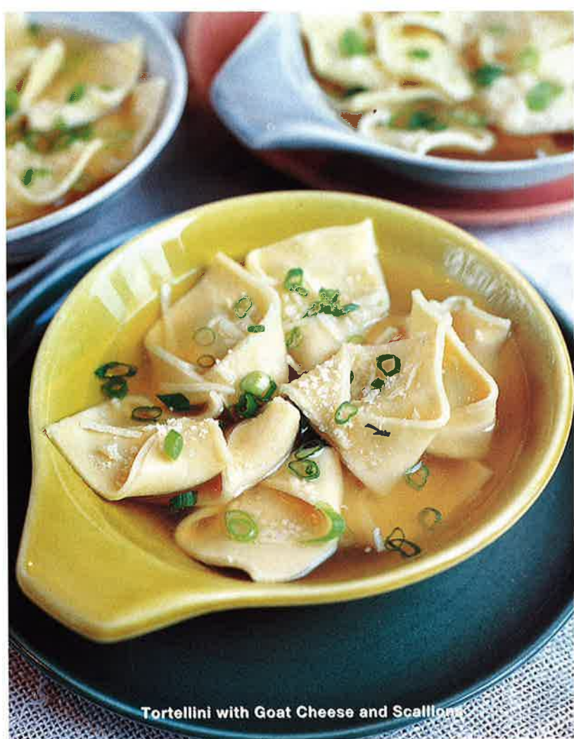
Tortellini with Goat Cheese and Scallions