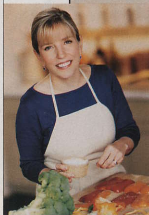
Sara Moulton says, "Never do fortune cookies on live TV."

Yield: 12 hors d'oeuvres / Prep Time: 15 minutes / Cook Time: 10 minutes / Ease of preparation: Easy