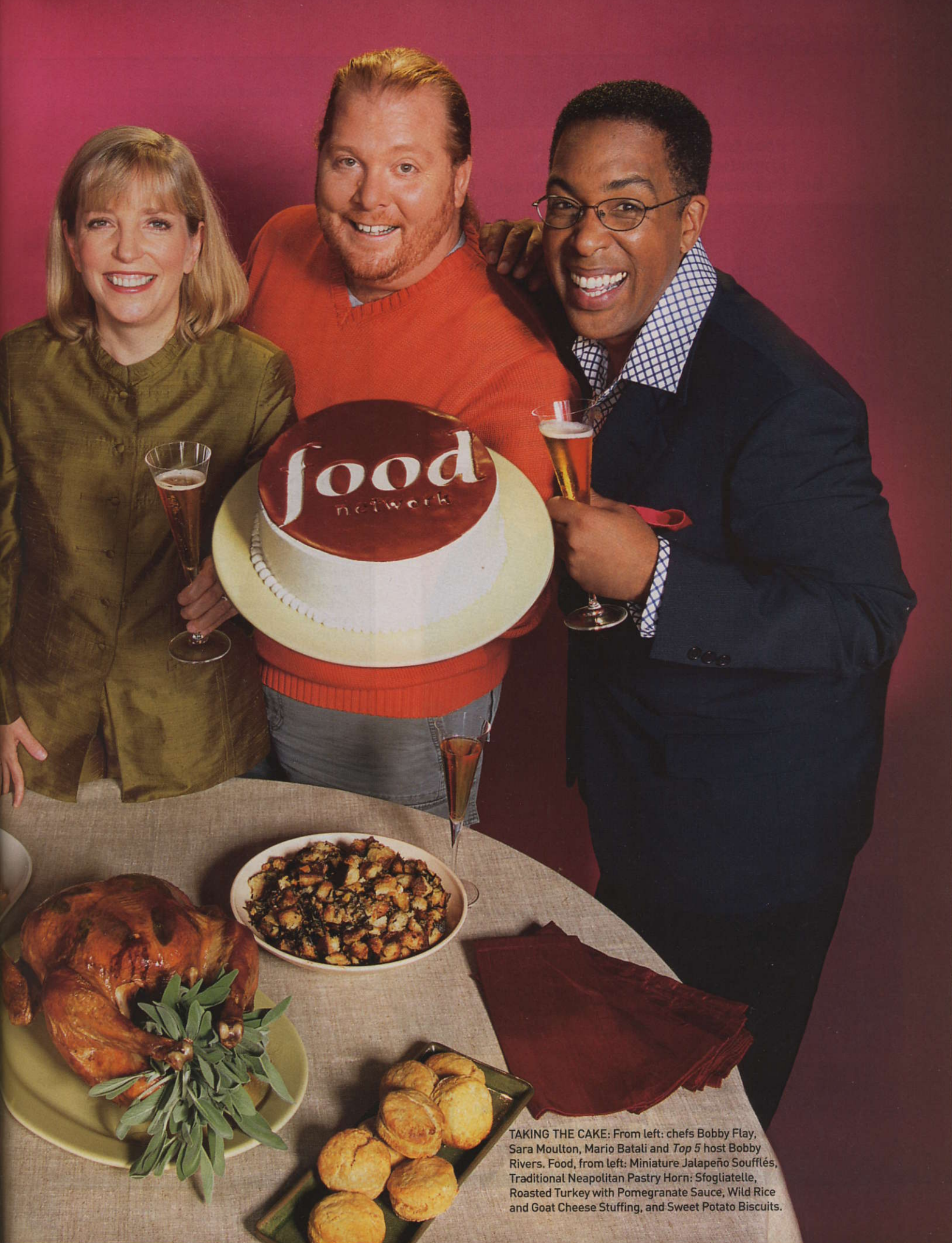
TAKING THE CAKE: From left: chefs Bobby Flay, Sara Moulton, Mario Batali and Top 5 host Bobby Rivers. Food, from left: Miniature Jalapeño Soufflés, Traditional Neapolitan Pastry Horn: Sfogliatelle, Roasted Turkey with Pomegranate Sauce, Wild Rice and Goat Cheese Stuffing, and Sweet Potato Biscuits.