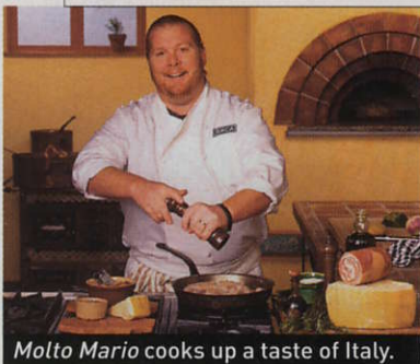
Molto Mario cooks up a taste of Italy.

Food Network started out with just a few slices of humble pie. But there were hints of what lay ahead.