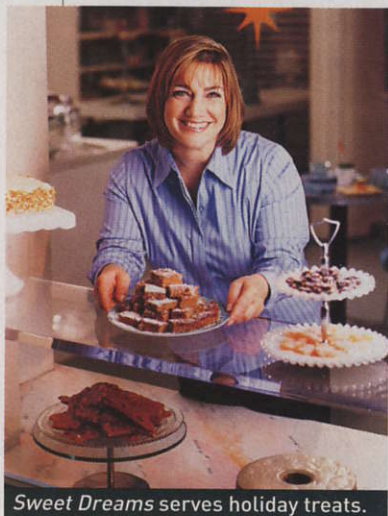
Sweet Dreams serves holiday treats.

funky restaurants and go on tour. But what do these rock stars have to do with food? "They are obsessed with food but don't know anything about it," says Opatut. "We're on a road trip with them and their adventures. They're really curious, sincerely passionate about food and a lot of fun." Other future shows include What America Eats , a look at American food habits; The Fearless Host , a makeover show that tackles the fear of entertaining; and a special on wines with actor John Cleese.