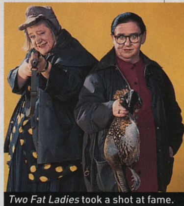
Two Fat Ladies took a shot at fame.

LIKE THE FINEST CUISINE , Food Network began with the simplest and purest of ingredients: a passion for food and the desire to share it with others. Launching on November 23, 1993, the channel brought basic how-to shows into just 6.5 million homes. Included in the early mix was a little-known,